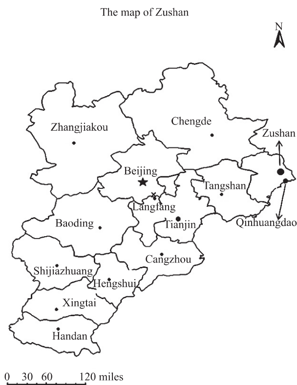
Figure 1. Zushan Town Area

Zushan Town is located in the southeastern part of Qingcheng Manchu Autonomous County along the Great Wall. It is known as the "Dongdaemun" of Qinglong. It is only 50km away from Qinhuangdao downtown. It passes through Qinhai Highway and Qinqing Highway through the town. It is Chengde, Inner Mongolia and other places. The location of the throat leading to the sea is excellent (see Figure 1). Zushan Town is a national autonomous region that is rich in resources and economic poverty. It has jurisdiction over 16 administrative villages and has a total area of 354 km 2 . By the end of 2017, the town has a permanent population of 24,200, a floating population of about 4,000, and a cultivated area of 1,670 hectares. At the end of 2004, the total production value of the town was 3.25 billion yuan. The added value of the first, second and third industries was 70.72 million yuan, 107.45 million yuan, and 100.55 million yuan respectively. The proportion of one, two and three industrial structures is 25.4:38.5:36.1.